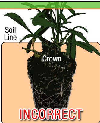
Do NOT bury the crown of the plug