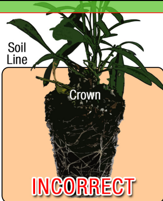
Do NOT bury the crown of the plug