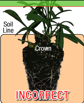
Do NOT bury the crown of the plug