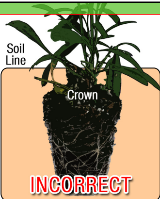
Do NOT bury the crown of the plug

Possible Problems: Insect : Slugs might sample it Diseases : With poor drainage, crown and root rot could be an issue