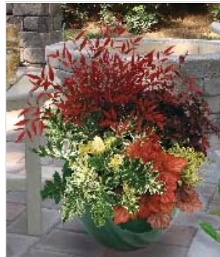
Terra Nova Nurseries

Perennial plants make a splash in flowerpots, planters and window boxes. Many perennials are especially known for their foliage, and a combination of several plants that makes the most of foliage texture and color will look fantastic all season long.