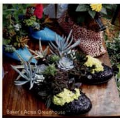
Baker's Acres Greenhouse