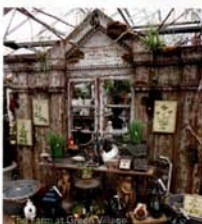
The Annual Greenhouse