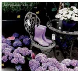
Acry's Garden Center