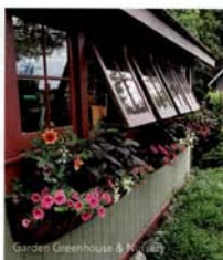
Garden Greenhouse & Nursery