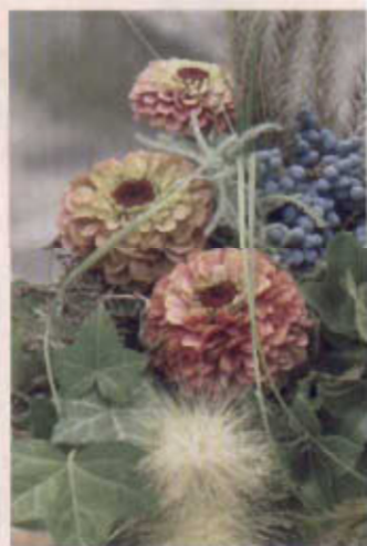
Zinnia elegans Queen Red Lime from Benary.