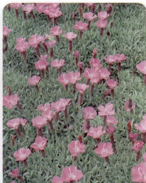
Dianthus gratianopolitanus 'Petite'

Tiareella 'Mystic Mist' is an excellent plant for four-season landscape intrigue. Bred by Terra Nova Nurseries for vigor, this Tiarella offers landscapers bright-green foliage with white, speckled variegation and red veins from spring to