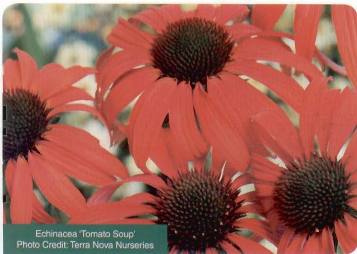
Echinacea 'Tomato Soup'

flowers bloom on short spikes in early summer. Dianthus 'Petite' fills in perfectly around taller perennials, between pavers or as a lawn substitute. It should be planted in soil or gravel but needs sharp