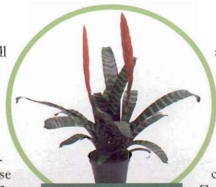
Vriesea Splendrite Bromeliad

Often referred to as Northern Bush Honeysuckle, Diervilla sessilifolia 'Cool Splash' is an inaugural variegated form of Diervilla and will stop passers-by in their paths. Panicles of yellow trumpets cover this striking, variegated foliage, which will add