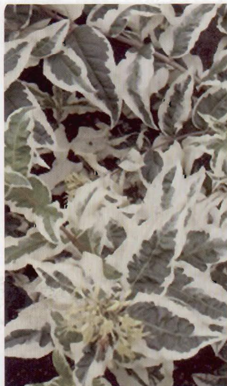
Diervilla variegata 'Cool Splash'

"Few plants are as charming in the landscape as Dianthus gratianopolitanus 'Petite,'" says Fran Hopkins, president and founder of Stepables, a line of creeping perennials. "This drought-