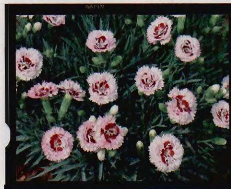
Dianthus 'Raspberry Surprise'

For smaller spaces, Garden Splendor now offers Dianthus 'Raspberry Surprise' . This perennial was selected for its long and free-flowering capabilities, compact and well-proportioned habit,