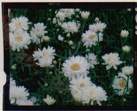
Leucanthemum 'Paladin'

Leucanthemum 'Paladin' offers a new and unique flower type for a Shasta daisy with three rows of ruffled petals on