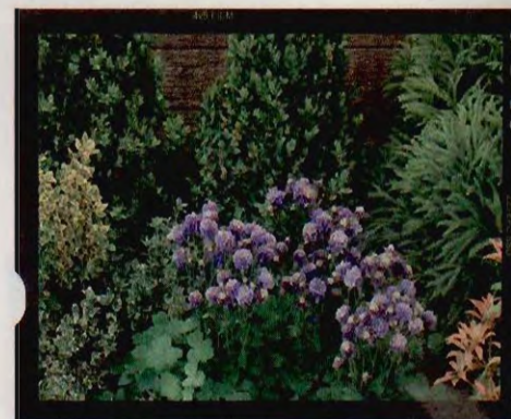
Aquilegia 'Winky Double Blue & White'

For colder climates, landscapers may want to look at the new Aquilegia 'Winky Double Blue & White' from Garden Splendor. This perennial is hardy to