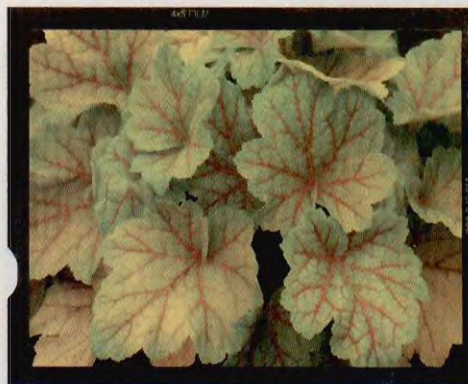
Heuchera 'Electra'

Terra Nova Nurseries' production team has taken a great interest in 2010 toward introducing heucheras that vary in color over four seasons. Heuchera 'Electra' is the perfect selection for landscapes in