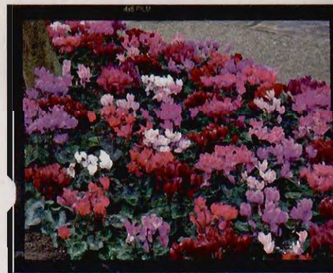
Laser Cyclamen

Laser Cyclamen from Goldsmith Seeds / Syngenta are perfect options for dramatic color in fall, winter and early