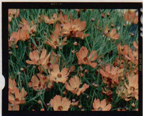
Coreopsis 'Mango Punch'

Coreopsis 'Mango Punch' belongs to Terra Nova Nurseries' new series of annual coreopsis, which are available in a brilliant