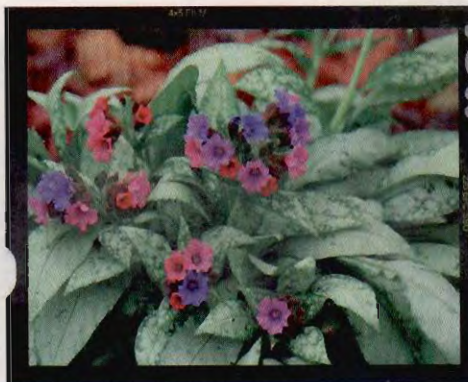
Pulmonaria 'Silver Bouquet'

Hybridizing Pulmonaria at Terra Nova Nurseries leads to plants that are bred for superior mildew resistance, short bloom stalks, vivid flower colors, and thick, well-spotted foliage. Pulmonaria 'Silver Bouquet' offers all of these traits as well as heat and humidity tolerance, an upright habit, and large pink flowers. This is also the first new Pulmonaria introduction from