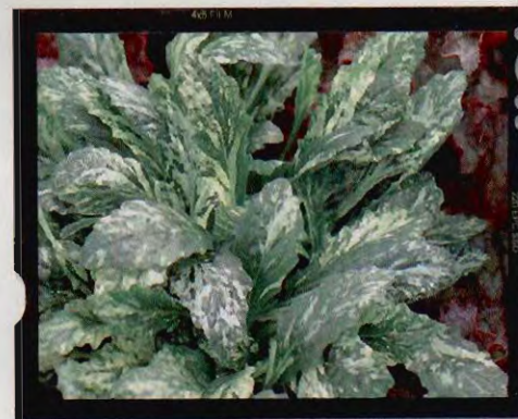
Ajuga 'Sparkler'

The new variegated Ajuga 'Sparkler' has thick, dark green, shiny foliage covered in creamy-white splashes that light up the floor of a garden. 'Sparkler' is the most vigorous and variegated ajuga in Terra Nova