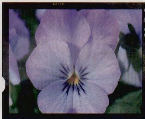
Endurio 'Sky Blue Martien'

The brand new Viola Endurio 'Sky Blue Martien' from Syngenta is another annual worth a professional landscaper's second glance for its breeding prowess and innovation. This striking, pale-blue, semi-trailing viola has a neatly mounding, spreading habit that cascades in any applica-