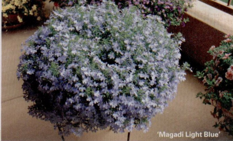
'Magadi Light Blue'

unique, psychedelic soft to mid pink and white pattern are highlighted by a splash of color that ranges from morn to star.