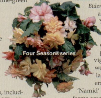
Four Seasons series

'Namid' flowers early and performs great for the consumer.