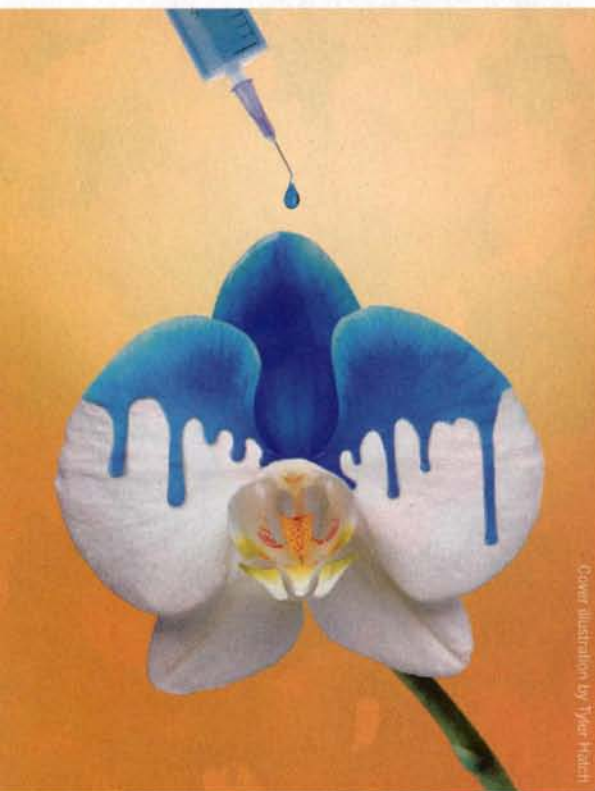
Cover illustration by Tyler Hatch