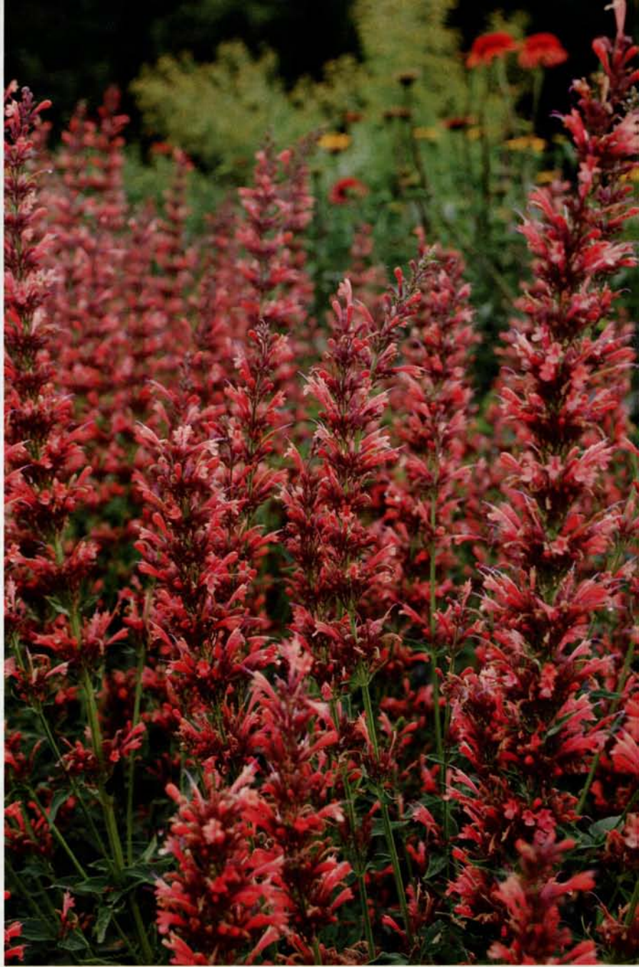
A. 'Summer Fiesta' has 28-inch-tall flower spikes that bloom from summer until frost.

Powdery mildew can be a problem with any mint, but giant hyssop seems to thwart it, perhaps because of its airiness. Pests don't bother this plant because, frankly, it reeks. It smells like catnip to me,