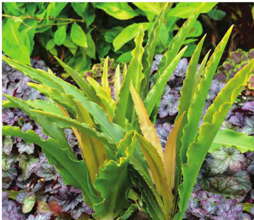
Eucomis 'Glow Sticks'