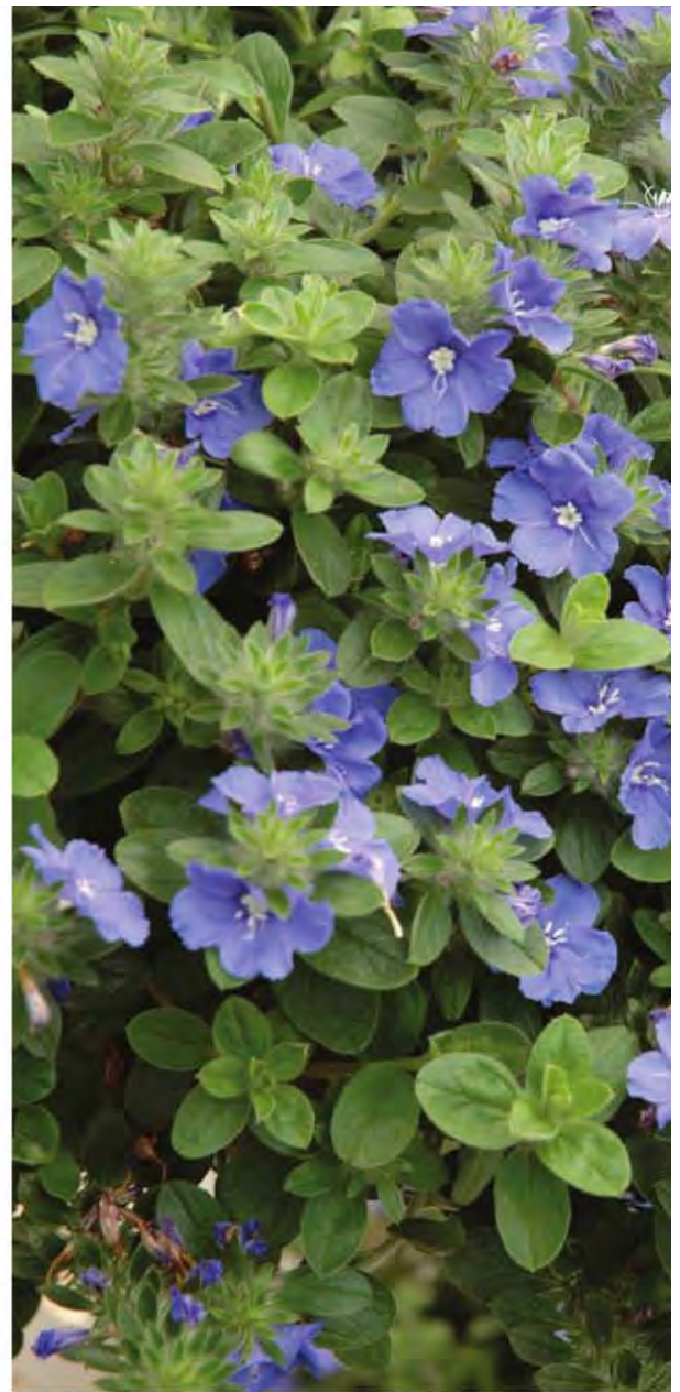
Evolvulus Blue My Mind

The Dallas Arboretum Trial Program takes data on 7,000-plus annuals, perennials, woodies, grasses and trees each year, looking for the toughest of the tough. North Texas is a brutal climate that can swing from one extreme to another; six months of drought is usually followed by a month of flooding. Many of the arboretum's trials focus on heat tolerance and ability to withstand low water requirements, because Texas is experiencing water restrictions like other states. We highlight some great drought-tolerant contenders here.