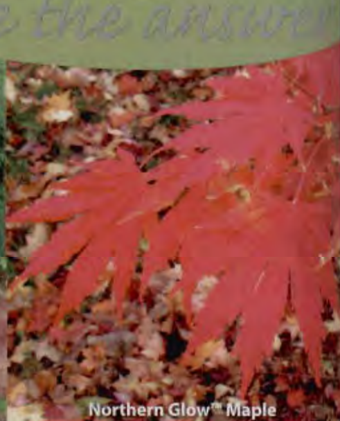
Northern Glow™ Maple