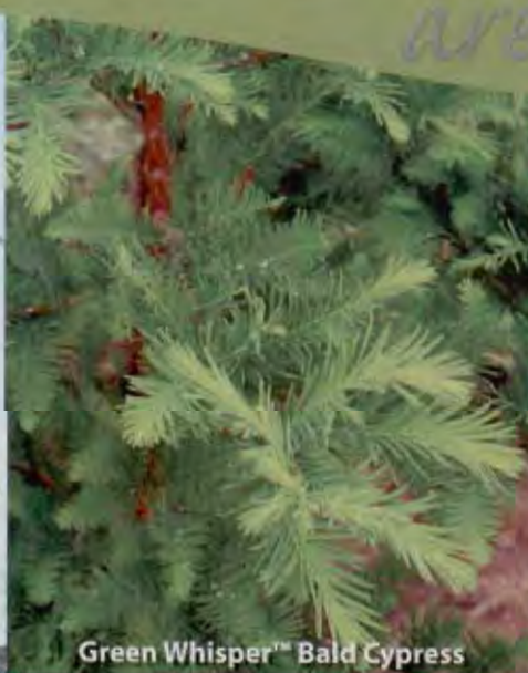
Green Whisper™ Bald Cypress