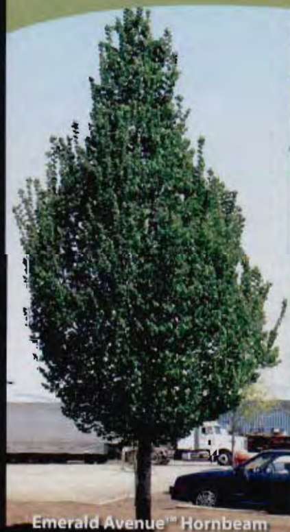
Emerald Avenue™ Hornbeam