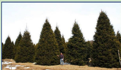
Photo - 20-22 ft Norway Spruce

COLSON'S NURSERY, INC. 7631 Deep Creek Loop, Bonners Ferry, Idaho 83805 208-267-7792 • www.colsonsnursery.com