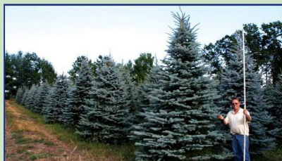
Photo - Blue Spruce with 10 ft measuring pole

Trees Available: (8' - 25') Norway, White, Blue and Serbian Spruce