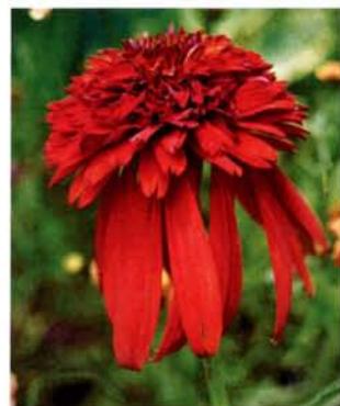
‘Hot Papaya’ Double red-orange flowers are fragrant; 30 to 36 in. tall, 24 to 30 in. wide; cold zones 4 to 9, heat zones 9 to 1

Double flowers, orange flowers, yellow flowers — what’s come over good, old-fashioned coneflowers? Exciting new colors and shapes take this dependable favorite into the future. But which ones should you buy? Check out these three cultivars that get top marks.