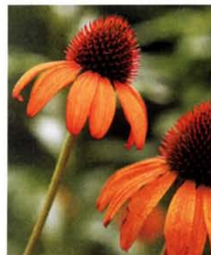
‘Tiki Torch’ Pumpkin-orange flowers in summer; 24 to 36 in. tall, 18 to 24 in. wide; cold zones 3 to 9, heat zones 9 to 1