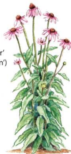
‘Bright Star’ (‘Leuchstern’)

Try a drift of coneflower and see how easy it is to bring a bit of the wild into your garden.