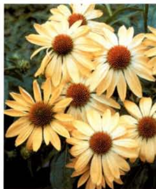
Big Sky™ ‘Sunrise’ Butter-yellow flowers fade to cream; 24 to 36 in. tall, 18 to 24 in. wide; cold zones 4 to 9, heat zones 9 to 1