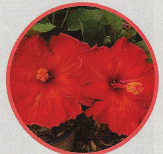
Hollywood Hibiscus Playboy