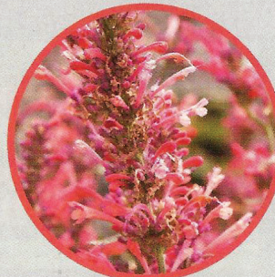
Agastache 'Kudos Coral'