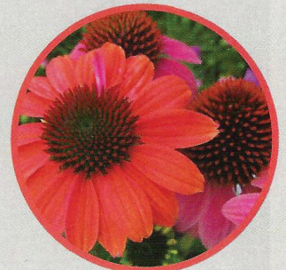
Echinacea Sombbrero Hot Coral