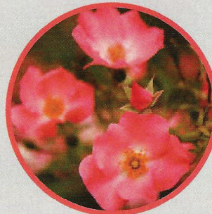
Flower Carpet Rose Coral