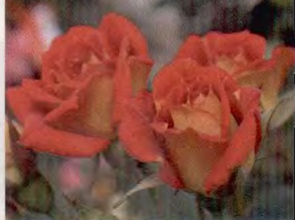
Rose Boogie Woogie

Walters Gardens' 'Shockwave' has large clusters of lavender pink flow-