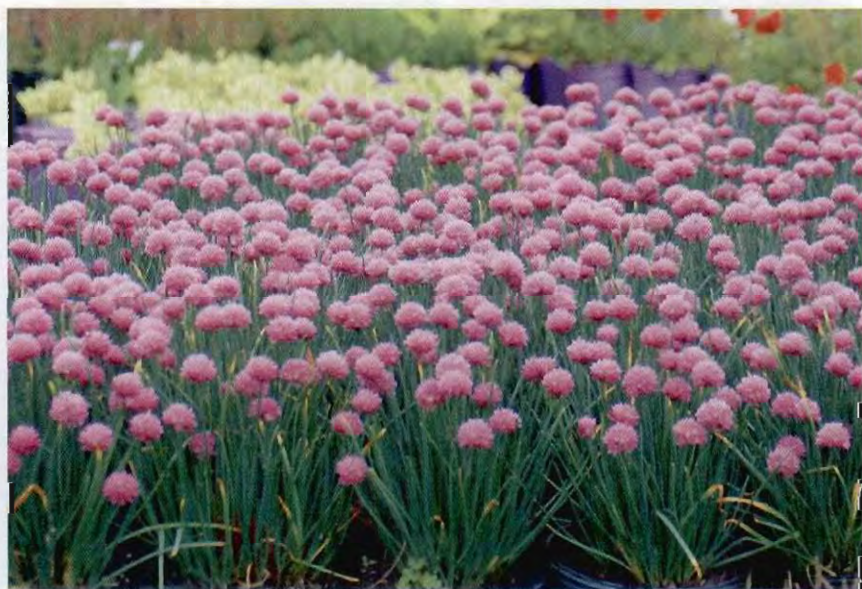
Amsonia 'Spring Sky'