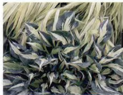
Hosta 'American Hero'

white flowers with heavy red streaking and dark-red, ovate leaves. ' Little Prince ' has 10-inch lavender flowers with pink petal edges and green leaves. ' Kui Nuku ' means little one in Hawaiian. It has 11-inch lavender-mauve flowers and dark purple leaves. ' Small Wonder ' features 10-inch white and pink flowers with red and pink streaks and markings covering the petals front and back. It has small, black-purple leaves. ' New Old Yella ' has 10-inch creamy yellow flowers and small green leaves. ' Pink Comet ' features 10- to 11-inch white/pink flowers with bright-red and pink markings on both sides of the flowers and small, shiny green leaves. ' Satellite ' stands 1½- to 2½ feet tall and features 9- to 10-inch shiny magenta flowers with tiny purple leaves.