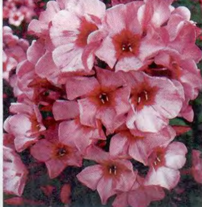
Phlox Red Caribbean

Darwin Perennials' dwarf Phlox paniculata Top Shelf series has exceptional mildew tolerance and stronger flowers, meaning longer shelf life and better