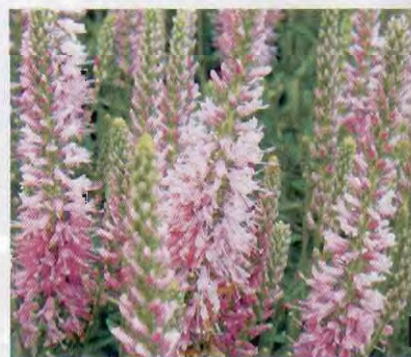
Veronica Inspire Pink

Boogie Woogie has been added to Greenheart's Table to Garden program. It features bright red-orange flowers with yellow reverse, 35-40 petals and a 2½-inch diameter when fully open.