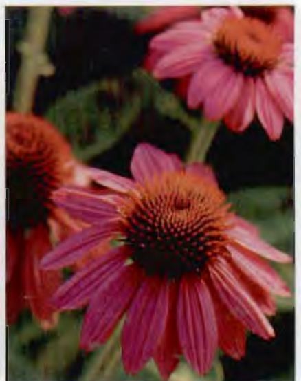
Echinacea PowWow Wild Berry

The PowWow series from PanAmerican Seed puts more flowers on every plant than any other seed echinacea, whether