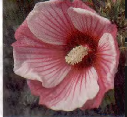
Hibiscus 'Small Wonder'

Fleming's Flower Fields introduces its Fleming Dwarf series. These hybrids reach 2½- to 3-foot tall and require no growth regulators. They are hardy to -30°F and bloom from top to bottom of the plants. ' Copper Queen ' has 11-inch