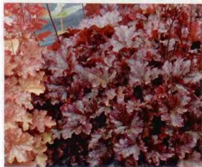
Heuchera 'Berry Marmalade'

In honor of the 25 th anniversary of its Magnus series, Jelitto Perennial Seeds adds ' Magnus Superior .' It is intense carmine-red in color with darker flowers and stem color, plus more consistent growth. It has an upright growth habit reaching up to 40 inches tall.