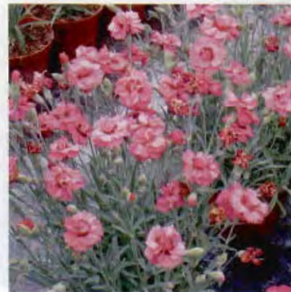
Dianthus Twilight Star

The SuperTrouper series from Selecta fits well into pot, bedding plant and perennial programs. Plants have a good branching, uniform habit, large color range and a nice scent. Butterfly Dark Red adds a brilliant bicolor to the series. Pink evol. and Light Pink evol.