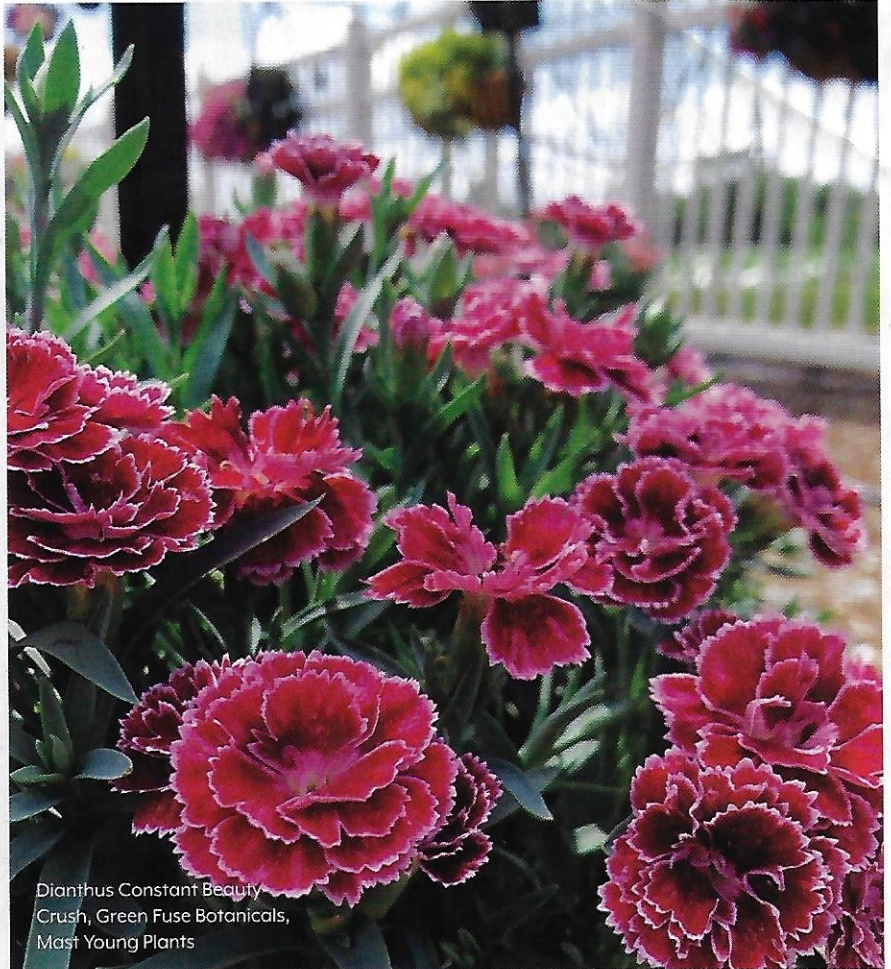
Dianthus 'Constant Beauty' Crush, Green Fuse Botanicals, Mast Young Plants