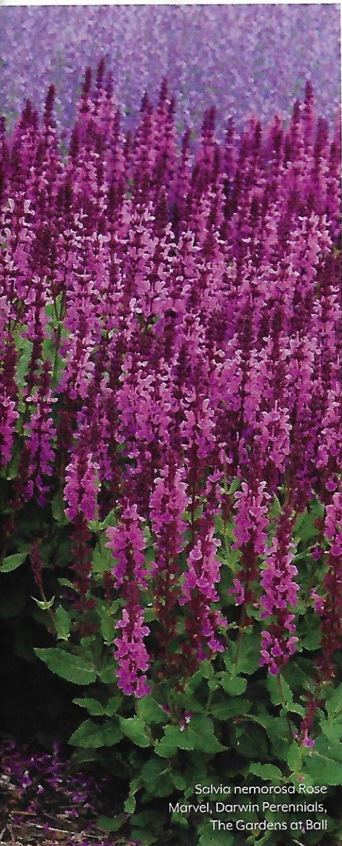
Salvia nemorosa 'Rose Marvel', Darwin Perennials, The Gardens at Ball