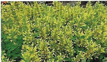
Agastache 'Poquito Butter Yellow,' Terra Nova Nurseries, University of Georgia

blooming, even under the hottest conditions. Hardy to zone 4.