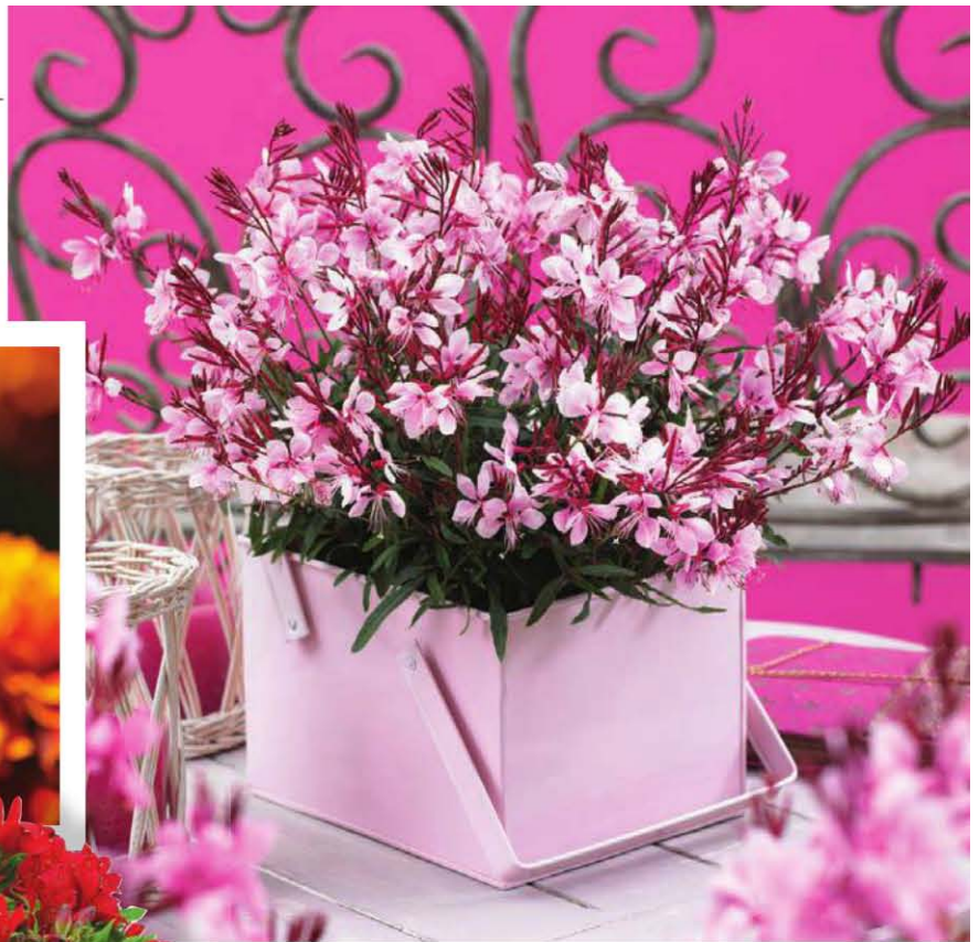
Gaura Gaudi Pink from Florensis