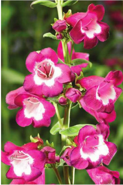
Arabesque Violet penstemon from Syngenta