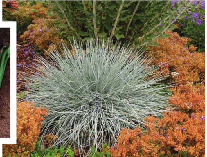
Festuca Beyond Blue from Skagit Gardens