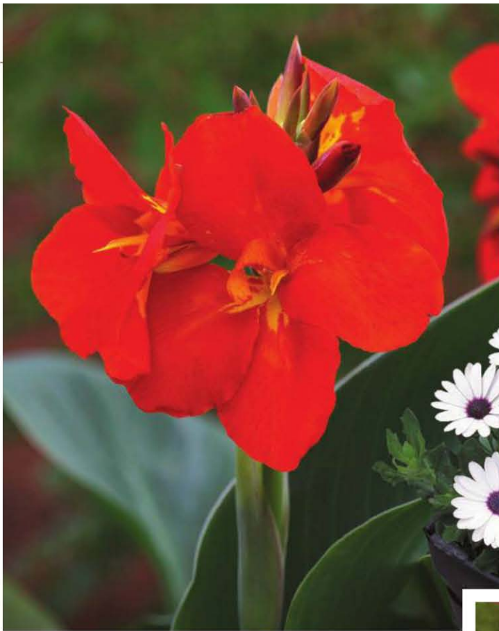
Canna F1 South Pacific (left) and Osteospermum Passion White (middle) from American Takii; Nonstop Rose Petticoat (below) from Ernst Benary of America