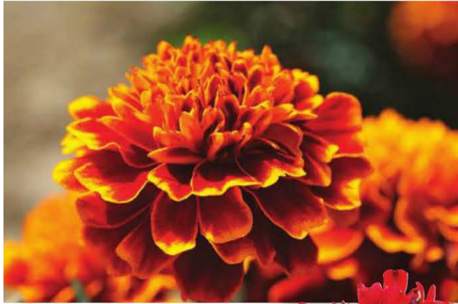
Marigold Cresta Flame (above) from Floranova; Alstroemeria Inca Vito (right) from Flamingo Holland