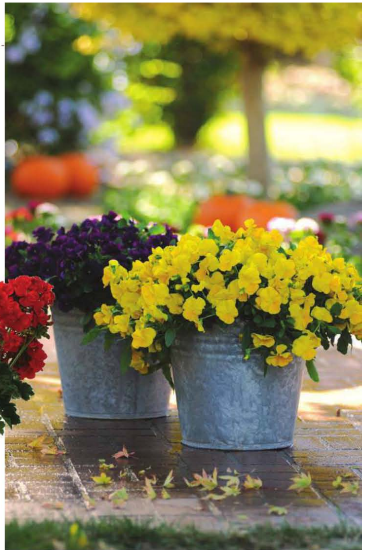
Cool Wave Pansies Purple and Golden Yellow from PanAmerican Seed

Another addition from Kieft Seed is the Gerbera Mega Revolution Select Mixture to the Mega Revolution series. Redesigned to deliver a gerbera with a larger plant and flower size, it delivers a quick crop time and is ideal for fully programmable, high-density production.