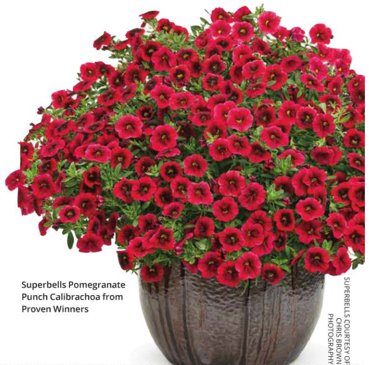
Superbells Pomegranate Punch Calibrachoa from Proven Winners

Moving from the South to the North this year, the Proven Winners site will be held at the Chaminade Resort and Spa in Santa Cruz. The company still plans on having a marketing presentation, as well as the experts taking visitors through the site to talk about the new varieties. The company hopes that by moving up north more Spring Trials attendees will be able to visit its site this year, espe-