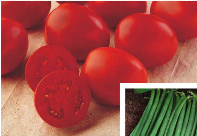
APT 410 (above) and Valentino beans (right) from Seminis