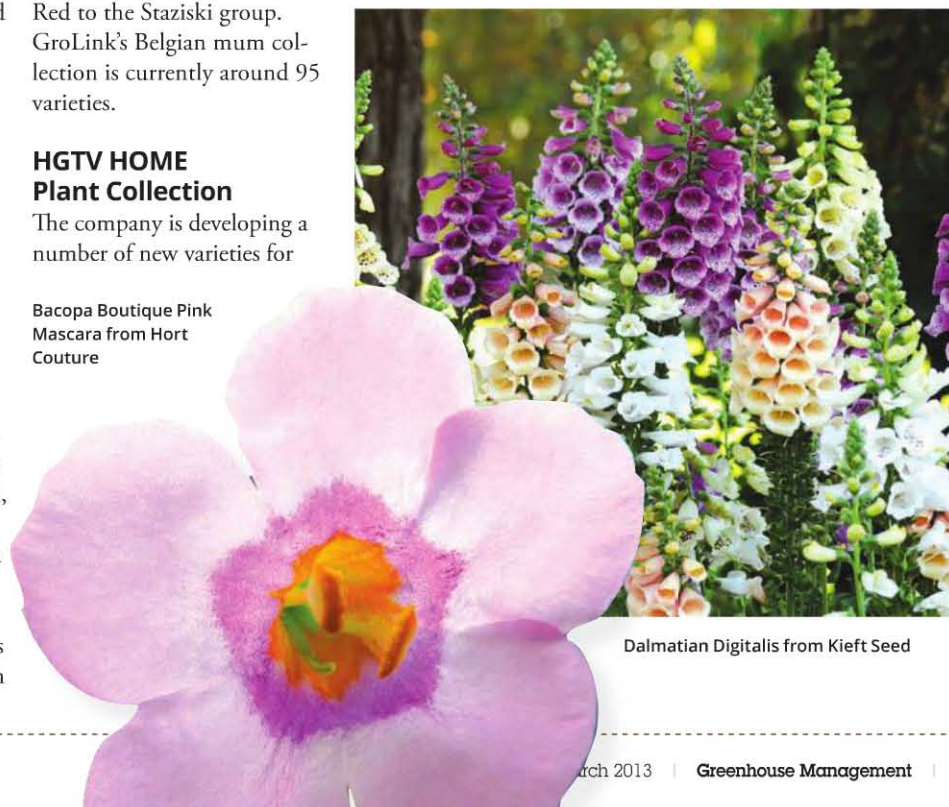
Bacopa Boutique Pink Mascara from Hort Couture

The Echinacea color mix, Echinacea Cheyenne Spirit, is now available from seed. An All-America Selections winner, it fills out pots, offering a higher in-store impact. The mix is hardy to Zone 4.