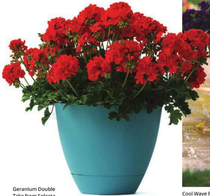
Geranium Double Take from Selecta