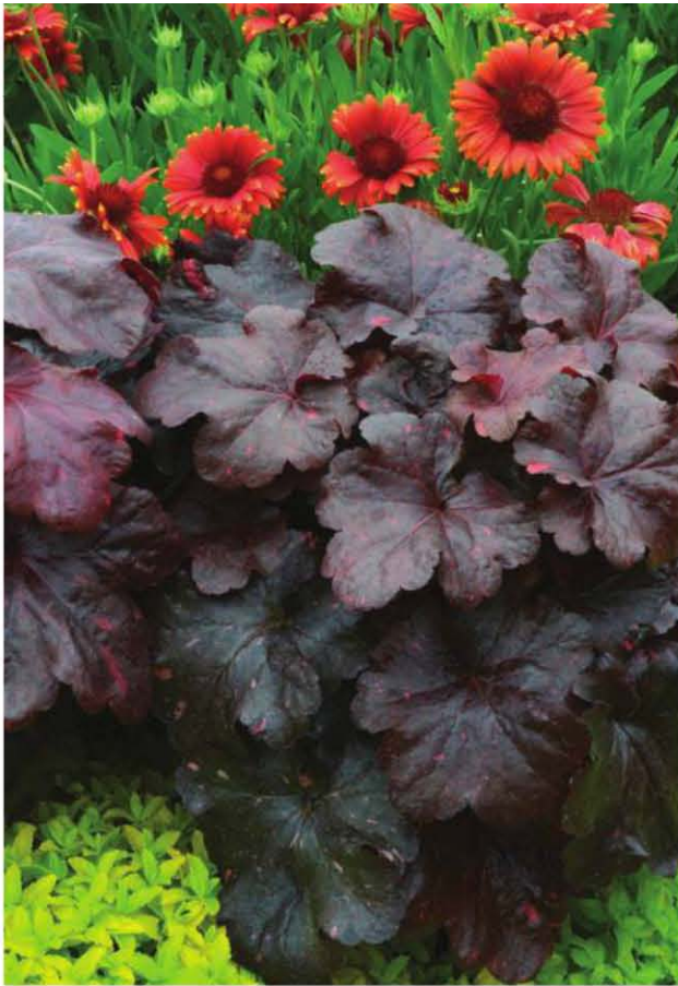
Heuchera 'Galaxy' from Terra Nova Nurseries