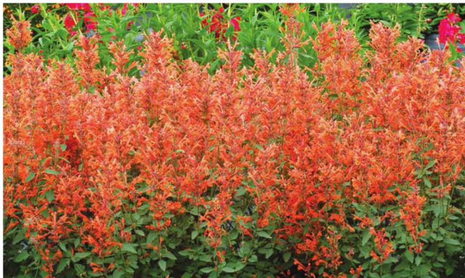
Agastache 'Kudos Mandarin' from Terra Nova Nurseries

Completely new crops for the Suntory Collection in North America will be introduced in two new series at this year's trials. Located at the Plug Connection site again, the company will have new additions to the Sun Parasol mandevillas: Red Emperor to the Giant group, and Pretty Deep Pink and Pretty Deep Red to the Pretty series. The Senetti, Surfinia and Million Bells series will also introduce sought-after colors.