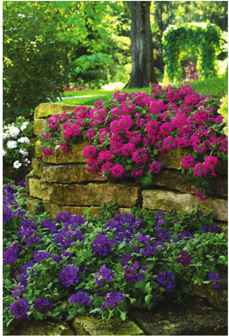
Verbena Enduro from Ball FloraPlant

cially since the trials are less than a week this year.