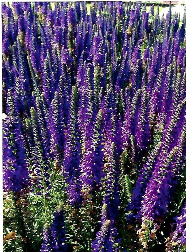
Veronica 'Venture Blue' (Terra Nova Nurseries), North Carolina State University

Compact, low growing plants that are covered in dark blue flowers. Continuous flowering spikes on sturdy upright stems. Low maintenance, easy to grow and no deadheading needed. Handles the heat well.