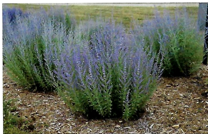
Perovskia 'Sage Advice' (Proven Winners), Walter's Gardens

This perennial is perfect for hot, dry climates, but performs well in a wide variety of environments. 'Sage Advice' has rich, lavender purple flowers that are a darker shade than other Perovskia to date. Compared to 'Denim 'n' Lace', this variety has darker flowers and calyces, broad (vs. dissected) foliage, and is slightly taller.