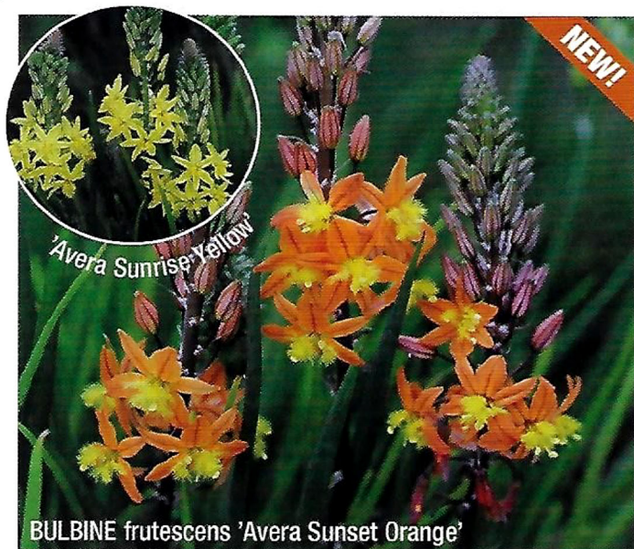
BULBINE frutescens 'Avera Sunset Orange'

The six colors of Kniphofia in the PYROMANIA Collection are tropical looking perennials but are hardy to zone 5b. 'Backdraft' has wide flower spikes that start out an intense reddish orange and open to a peachy yellow for a two-tone color effect. All members of the collection have excellent rebloom until late into the season and grass-like, textural foliage.