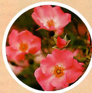
Flower Carpet Rose Coral