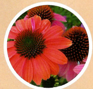
Echinacea Sombrero Hot Coral