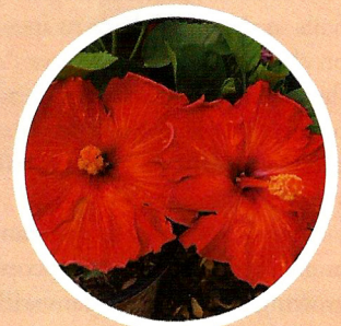
Hollywood Hibiscus Playboy