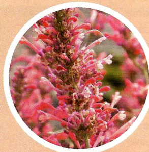
Agastache 'Kudos Coral'