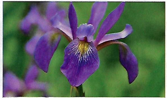
Iris versicolor 'Purple Flame' (North Creek Nurseries)

The first-ever spring blooming, Anemone, 'Spring Beauty' grows best in moist, well-drained soil. Hot-pink blooms are held above very upright growing foliage. Hardiness: Zones 4 to 8.