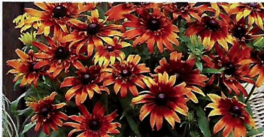
Echibeckia 'Summerina Blazing Fire' (Pacific Plug and Liner)

'Purple Flame's' true beauty lies in the irresistible foliage, which emerges in March. Purple, flame-like fans provide an unparalleled performance of vivid coloring followed by an encore of abundant flowers. Foliage slowly transitions to a smoky green during the growing season. Hardiness: Zones 2 to 7.