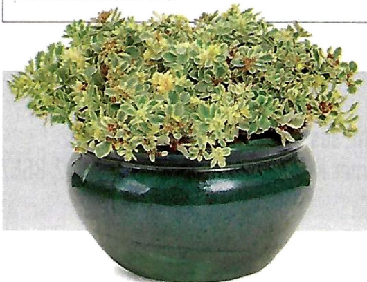
Sedum 'Boogie Woogie' (Walters Gardens)

'Orange Pekoe' features a unique and superb, tri-color combination of yellow, orange, and red. It flowers from July until September. Hardiness: Zones 5 to 9.