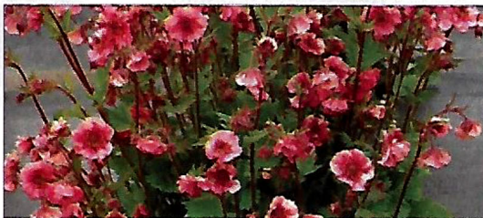
Geum 'Tempo Rose' (Terra Nova Nurseries)

'All Summer Beauty' has periwinkle-blue flowers that continue all summer with multiple flushes of blooms. Foliage and flowers are more dainty and graceful, yet also more floriferous than 'Rozanne.' Hardiness: Zones 3 to 8.