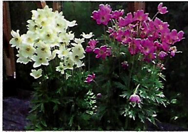
Anemone 'Spring Beauty' (Gardenworld, Inc.)

The first-ever spring blooming, Anemone, 'Spring Beauty' grows best in moist, well-drained soil. Hot-pink blooms are held above very upright growing foliage. Hardiness: Zones 4 to 8.