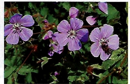
Geranium 'All Summer Beauty' (Plants Nouveau)

'Blazing Fire' is fast growing, can fill larger pots with only one liner, and flowers last for many weeks without needing to be deadheaded. 'Blazing Fire' will bloom continuously from late spring through first frost. Plants have overwintered as far as Zone 6. Hardiness: Zones 7 to 9.