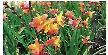
Crocsmia 'Orange Pekoe' (Rijnbeek and Son Perennials – Export B.V.)

Geum 'Tempo Rose' is an early bloomer that produces a plethora of dark, rose-pink flowers on short, dark stems. It has a long bloom time, allowing pollinators to enjoy this gem for months. Hardiness: Zones 5 to 9.