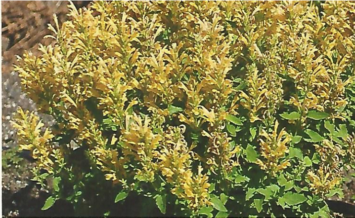
Agastache hyb. 'Poquito Butter Yellow'

'Poquito Butter Yellow' has increased hardiness and mildew resistance. Showy dense heads of butter-yellow flowers appear from spring to fall. With its low, compact, bushy habit, 'Poquito Butter Yellow' makes a great border perennial and is a colorful addition to containers. It is a great pollinator plant and drought tolerant once established.