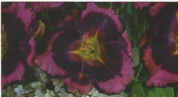
GG Hemerocallis 'Storm Shelter'

'Storm Shelter' is a medium-sized daylily with flower stems proportionate to the mound of foliage. An enormous eggplant-purple eye matches a ruffled picrust edge on the blooms, which are saturated in rich color.