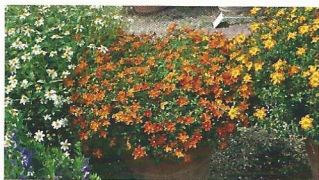
Bidens 'Bidy Boom Red' (Dümmen Orange), Colorado State University

Large amounts of long-lasting flowers were packed on a smaller, compact plant with a very tidy growth habit. Blooms also had very intense color to create a lot of flower power for a small plant. Bees love this flower as well as butterflies late in the season.