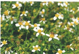
Bidens 'Bellamy White' (Benary), Dallas Arboretum

Large amounts of long-lasting flowers were packed on a smaller, compact plant with a very tidy growth habit. Blooms also had very intense color to create a lot of flower power for a small plant. Bees love this flower as well as butterflies late in the season.