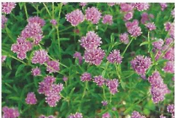
Gomphrena 'Truffula Pink' (Proven Winners), Dallas Arboretum

The Gomphrena 'Truffula Pink' looks great even in 100-degree heat and above. This Gomphrena can be compared to that of 'Fireworks' but is much more compact and not as wild-looking.