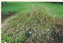
Gauriella Bicolor (Westhoff), Dallas Arboretum

The Gauriella Bicolor is a must-have for any perennial garden. The flowers are soft white with hints of pink along the edges. With nonstop blooms all season and a wonderful growth habit, this plant is unstoppable.