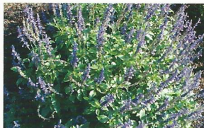
Salvia 'Rockin' Playin' the Blues' (Proven Winners), Dallas Arboretum

The Salvia 'Rockin' Playin' the Blues' is not only a pollinator-friendly perennial but a gorgeous burst of color to any landscape. This plant draws in butterflies, bees and even hummingbirds.