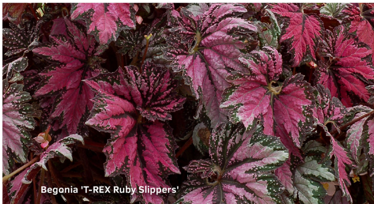
Begonia 'T-REX Ruby Slippers'