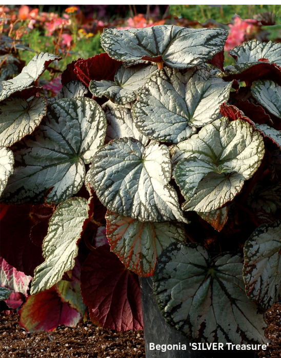
Begonia 'SILVER Treasure'