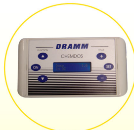
Easy to Program