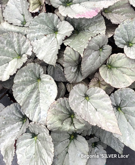
Begonia 'SILVER Lace'