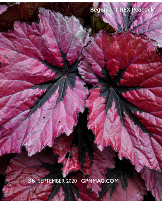
Begonia 'T-REX Peacock'

About 10 years ago, Terra Nova Nurseries embarked on a breeding program that would effectively end its propagation of open market varieties and switch to proprietary, protectable, cutting-edge breeding. The company examined what was lacking in the current offerings and what could be done to improve them. The Terra Nova breeders then came up with a few goals, made a plan and started sourcing the best species they could find to accomplish their stated goals. The company's close association with begonia enthusiasts and the Begonia Society helped achieve its target.