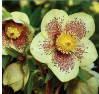
Winter Jewels Golden Sunrise

Walters Gardens is offering the Winter Jewels series, which was bred by Marietta O'Byrne of Eugene, Ore. There are five colors in the series to start, with more coming in future years. Golden Sunrise is a mixed strain of canary-yellow hellebores so each plant is slightly different. Some are solid yellow, but most exhibit red veining and a red picotee edge. Some have a contrasting red starburst at the center. Black