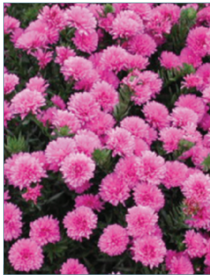
Royalty Pink Henry III

Pink Henry III is part of the Royalty series. This 1½-inch, double-flowered aster is rich pink. Plants are a few days later than Marie III, so they are a more precise match to Henry III.