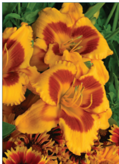
Designer Daylily Fooled Me

Fooled Me is part of the Designer Daylily series that is available from Walters Gardens. Flowers measure 5½ inches across and are