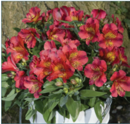
Princess Lilies Letizia

Letizia is the newest member of Royal Van Zanten's Princess Lilies series. Plants are quick