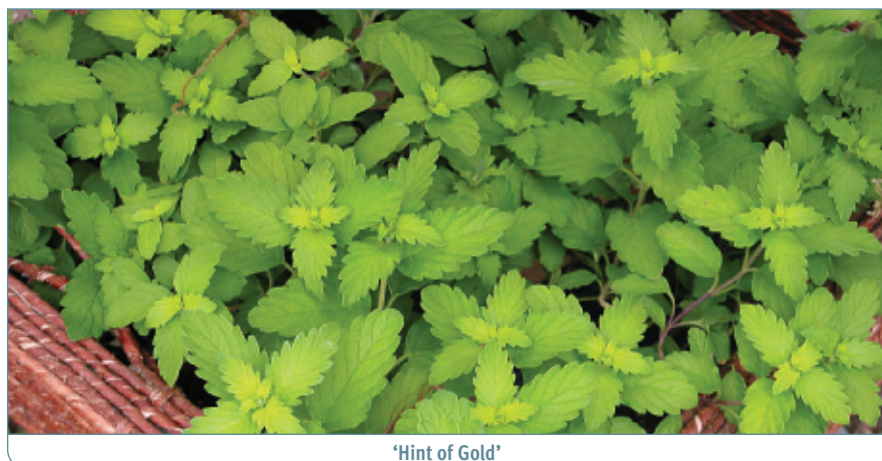
'Hint of Gold'

PlantHaven is offering ' Hint of Gold ,' which was bred by English plantsman Peter Catt. Plants have golden foliage that holds up well in the heat in the Southeast. Plants have a com-