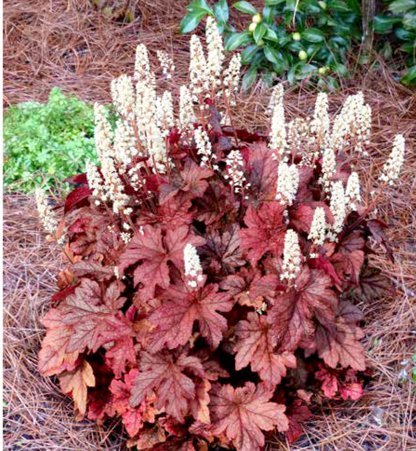
Heucherella 'Peach Tea'.

fragrant, beautiful tangerine flowers. This rose is a prize winner!