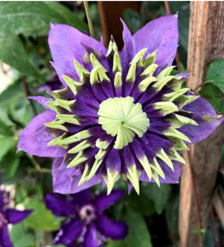
Clematis florida hybrida 'Taiga'

T hroughout my gardening life, I've anxiously awaited the January issue of gardening magazines featuring that year's new plant introductions. My frantic search would immediately ensue because I wanted to be the first to find and grow the newly introduced plants. I finally realized that many of the introductions were being marketed to growers who had to grow the plants for another year or two before they would be available to the