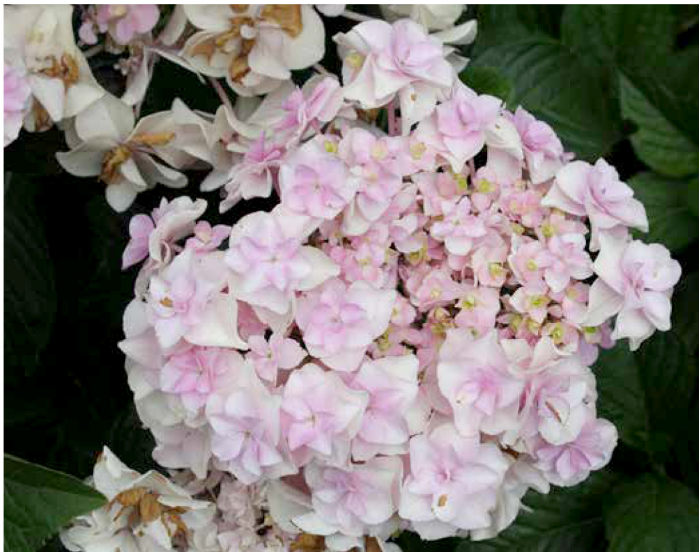
Hydrangea macrophylla 'Corsage'.